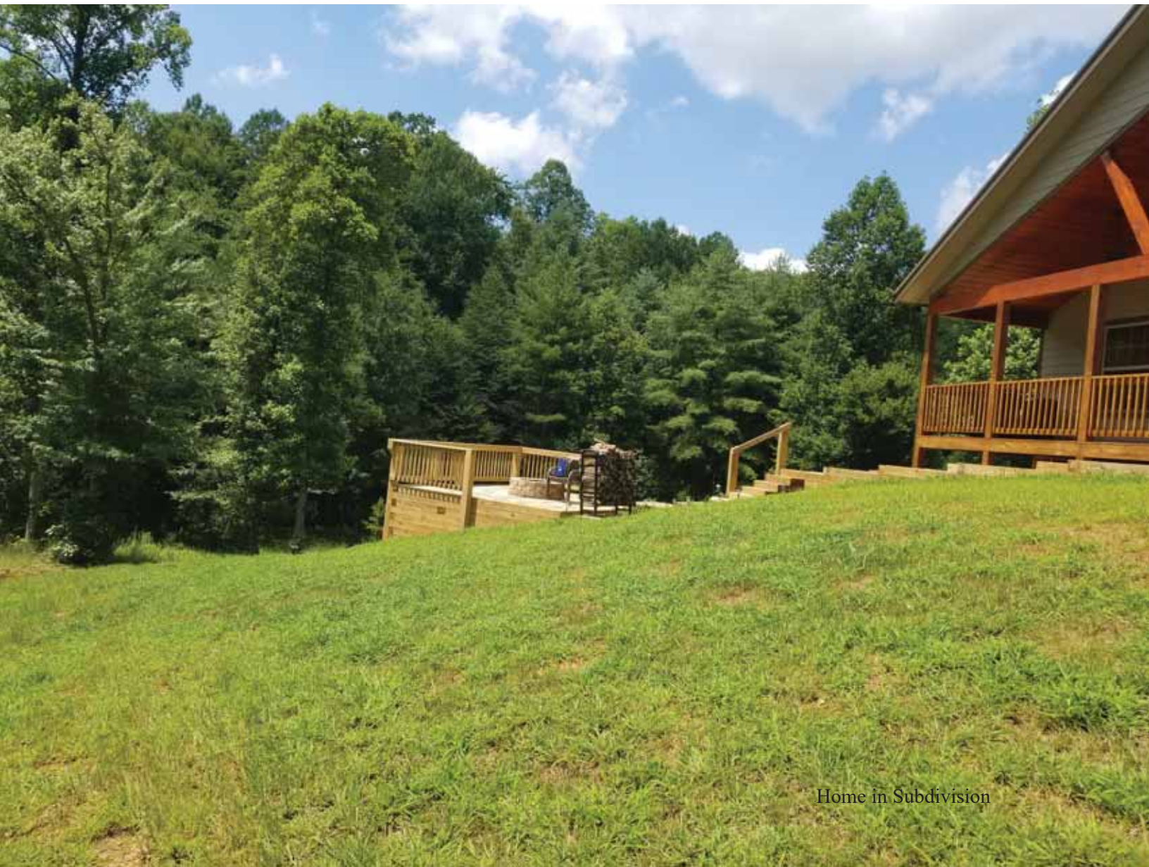
Home in Subdivision