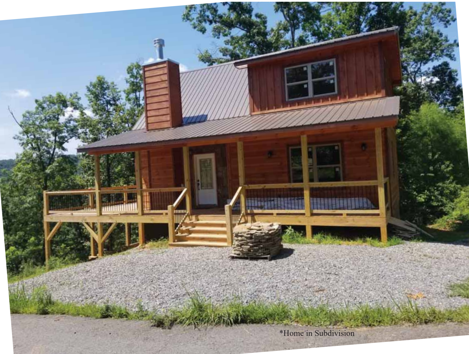
*Home in Subdivision