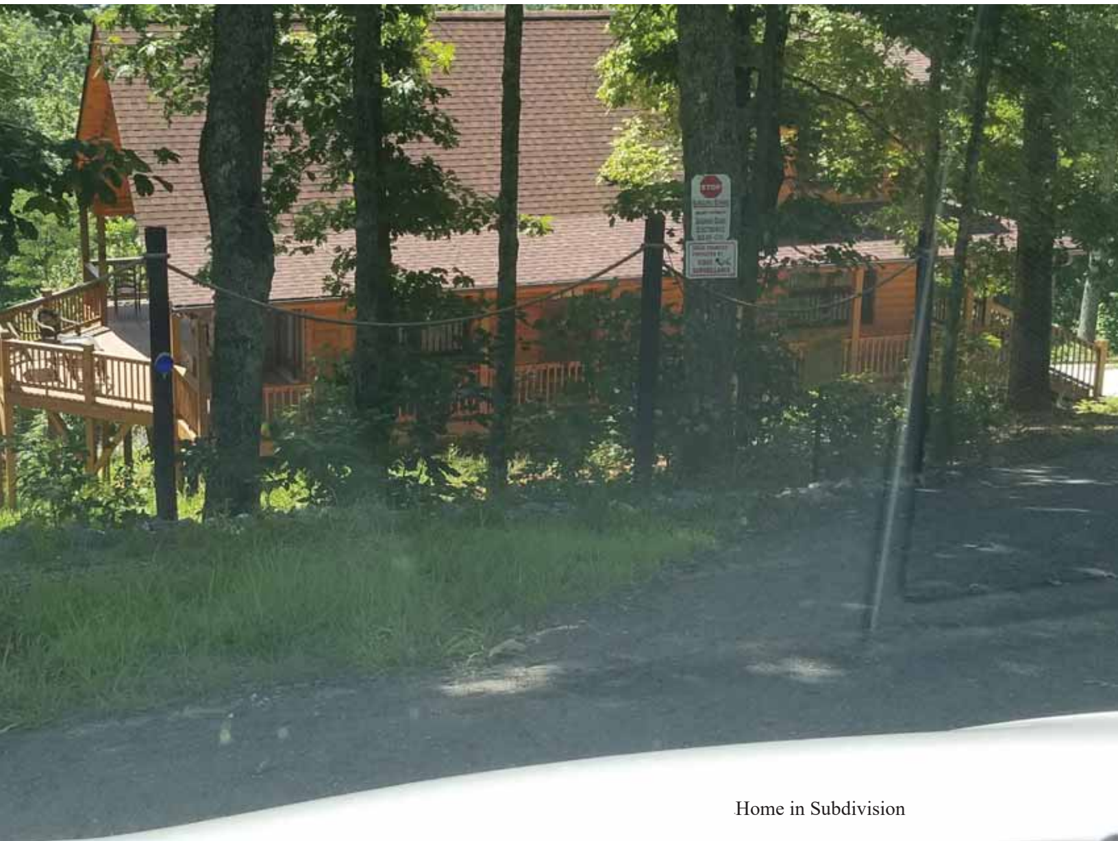
Home in Subdivision