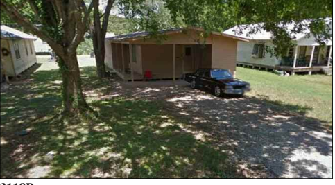
3118B Single Family Residences

406 Rivers Street, Smithville, TX 78957 Lot(s): 9; Blk 4 Subdivision: Eagleston Acres: 0.15± Year Built: 2009 Tax ID: 122388 Listing Agent: n/a Phone: n/a